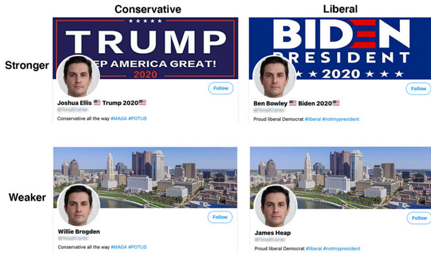
Fig. 1. Design of bot accounts. We created eight human-like, identical-looking bot accounts (two per each condition) and varied their political partisanship (Republican versus Democrat) as well as the extremity of political partisanship (stronger versus weaker). The bot accounts followed a set of elite accounts matching their political partisanship and retweeted randomly from these accounts every day (this was the same for bot accounts with stronger or weaker political partisanship). Bot accounts with stronger partisanship have a background supporting the Democrat versus Republican candidate and include the name of the candidate as part of their profile names.

among Democrats versus Republicans (interaction between copartisan bot and user partisanship, b = 0.012 [−0.071, 0.096], P = 0.771 , and P_{FRI} = 0.784 ). We also found no significant main effect of user partisanship, P = 0.563 and P_{FRI} = 0.583 , and no significant three-way interaction with bot extremity, P = 0.886 and P_{FRI} = 0.881 .